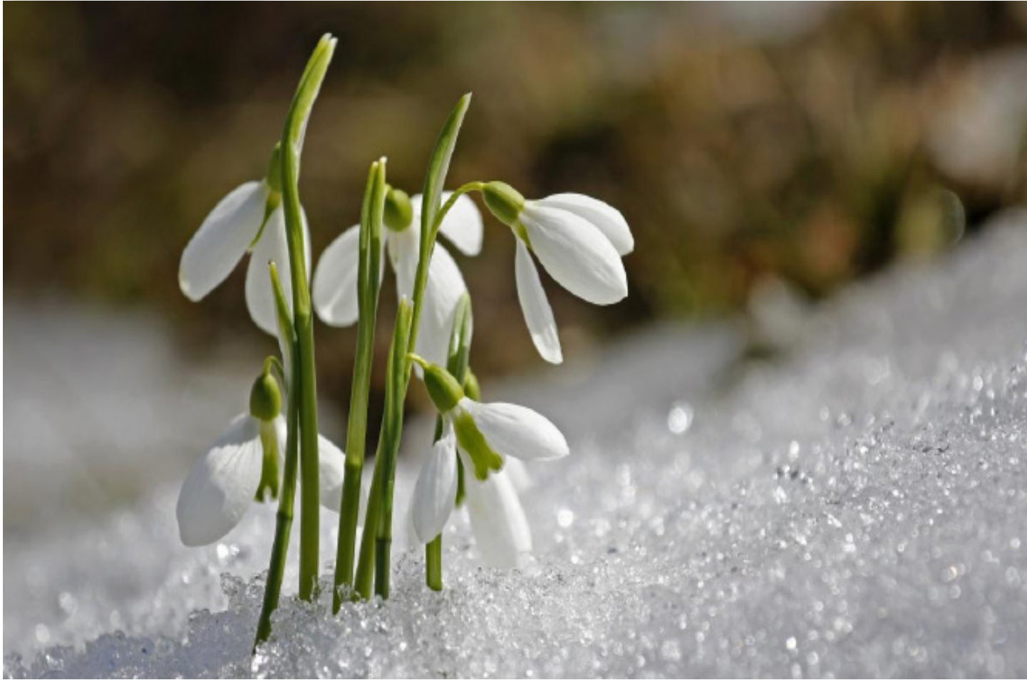
THERE IS SO MUCH HOPE IN A LITTLE FLOWER...SURROUNDED BY SNOW.

East Jordan Chamber (231) 536-7351 100 Main Street, Suite B East Jordan, MI 49727 ejchamber.org